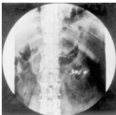
Figure 2 The radiogram of naso-pancreatic catheter in a patient.