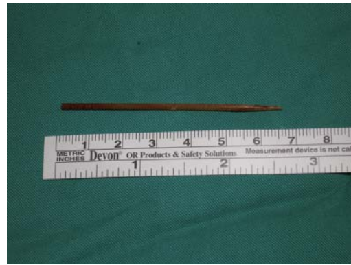
Figure 3 Gross findings of a toothpick measuring 6.5 cm in length.

Constrictive pericarditis was diagnosed based on clinical information. Tuberculosis (TB), malignancy, autoimmune disease, infection, hypothyroidism, and idiopathic could be the causes. Subsequent sputum TB smear showed negative acid-fast stain. Analysis of pleural effusion was recorded as follows: LDH 70 U/L, glucose 111 mg/dL, and WBC 1765 cell/ \mu L ( < 100 cell/ \mu L). Cytology of pleural effusion revealed no malignant cell. Pleural effusion smear was negative for bacteria or acid-fast stain. Autoimmune antibody study showed C3: 188 (90-180) mg/dL, C4 60.5: (10-40) mg/dL, and negative antinuclear antibody (ANA) ( < 1:80 ). Tumor marker revealed CEA 1.33 ( < 5 ) ng/mL and AFP 3.5 ( < 15 ) ng/mL. Thyroid function