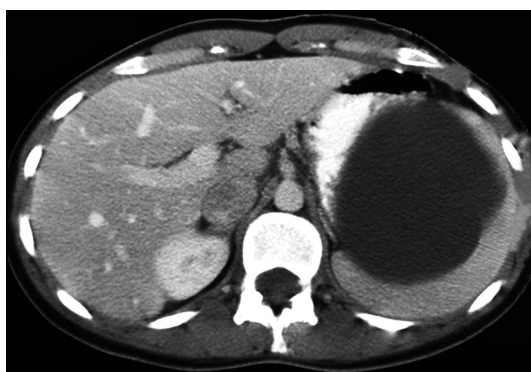
Figure 1 Plain abdominal CT scan showing the splenic localization of a large cyst displacing the remaining splenic parenchyma, the so-called "beak-sign".

and physical examination revealed a 6-7 cm palpable mass in the left upper quadrant of her abdomen. All laboratory tests were normal, and serological tests gave no evidence of parasitic infection with Echinococcus granulosus . Plain abdominal films of the abdomen were negative. Ultrasound and computerized tomography of the abdomen showed a solitary cystic mass in the splenic hilum with a maximum diameter of 8 cm, displacing the splenic parenchyma (Figure 1). Endoscopic examination of the upper gastrointestinal tract did not reveal any significant findings.